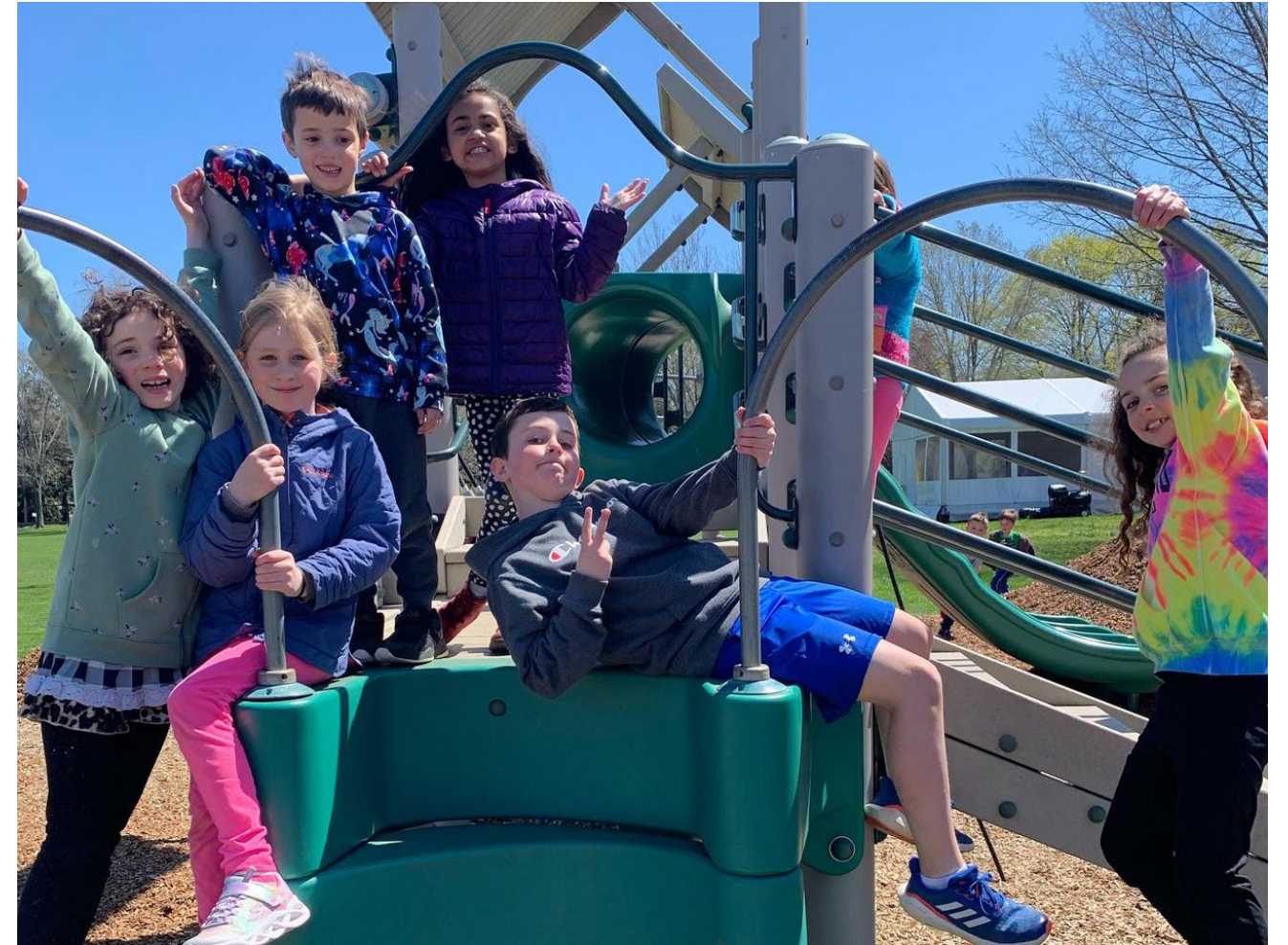
Children from the Guilford Before and After School Care Program.